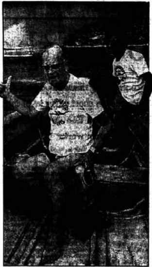
Sex claims: a Sunday newspaper has claimed that Arthur C. Clarke admitted to paying for sex with young children

ally or physically empty. In 1956, in pursuit of his obsession with skin-diving, he moved to Sri Lanka, that jewel in the Indian Ocean whose clear blue waters were the perfect setting in which to indulge his favourite pastime. As it happens, the island is populated with gorgeous brown children, whose parents are often so poor that they turn a blind eye to the distasteful sexual needs of wealthy foreigners.